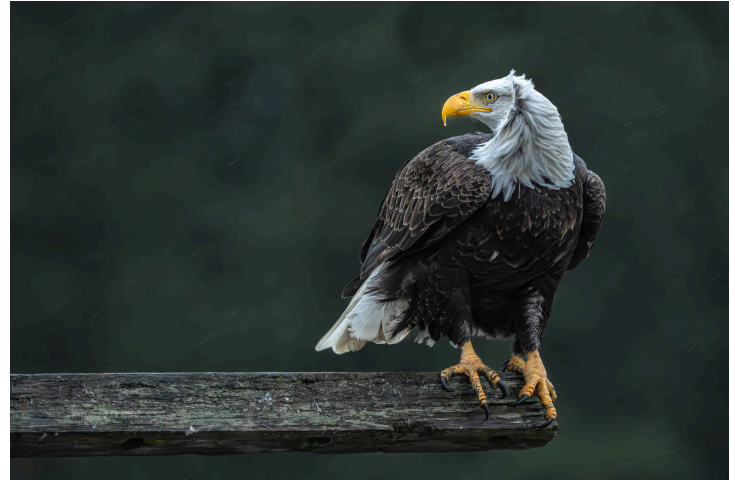
2024 prize-winning eagle photo by Don Heinsberg